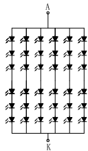
BACKLIGHT CIRCUIT DIAGRAM